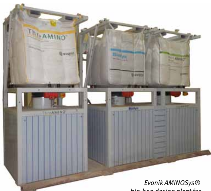
Evonik AMINOSys® big-bag dosing plant for three amino acids

In the first phase a maintainable embedded-Linux-based software platform was put together using the software management and build system e2factory. On this basis, the programmable logic controller (PLC) as well as the sensors and actuators of the unit were integrated using various serial interfaces and Ethernet.